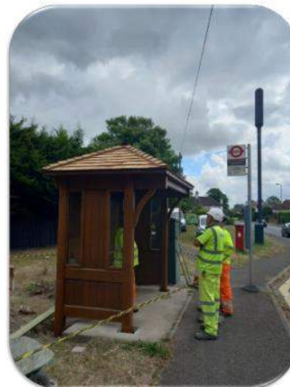
Replacement bus shelter on Fir Tree Road (A2022) with Sycamore Rise, Banstead, SM7